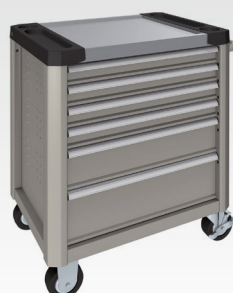
Silk grey RAL 7044

Colours may deviate due to the printing process.