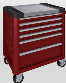
Ruby red RAL 3003