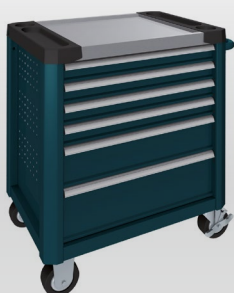
Ocean blue RAL 5020