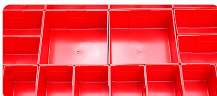
Plastic box set 12 pcs.: 150 x 75 mm, 6 pcs.: 150 x 150 mm Art.no. 100.293.000