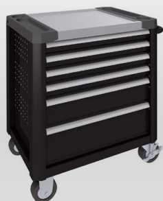
Deep black RAL 9005

Ask us for more colour options. We are happy to advise you.