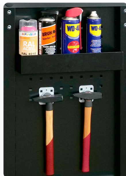
Spray can holder Art.no. 64.087.000