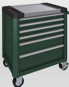
Pine green RAL 6028