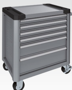
White aluminium RAL 9006