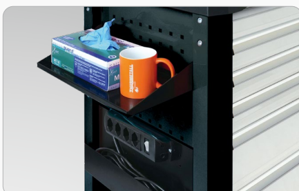
Additional rack Art.no. 64.086.000 Socket holding plate DE: Art.no. 81.086.000 CH: Art.no. 81.087.000