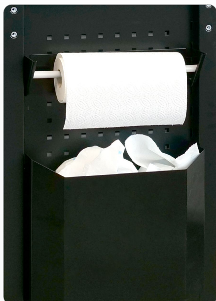
Paper roll holder for Ø 110 mm: Art.no. 81.082.000 for Ø 400 mm: Art.no. 81.058.000