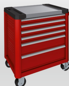
Carmine red RAL 3002